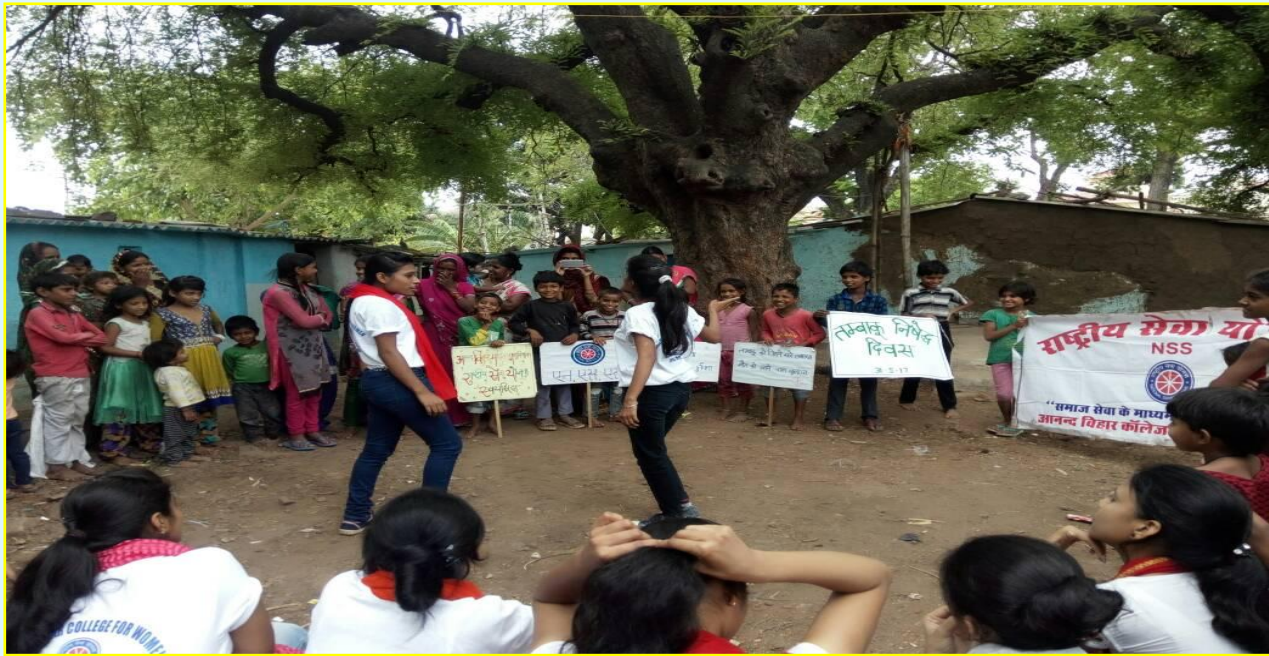
On World No Tobacco Day, students of NSS unit of college performed a Nukkad Natak explaining harms of tobacco and other addictive drugs.