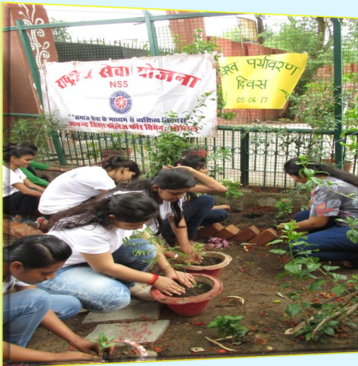
On World Environment Day, students planted saplings in the college premises and also gave environment conservation message through posters.