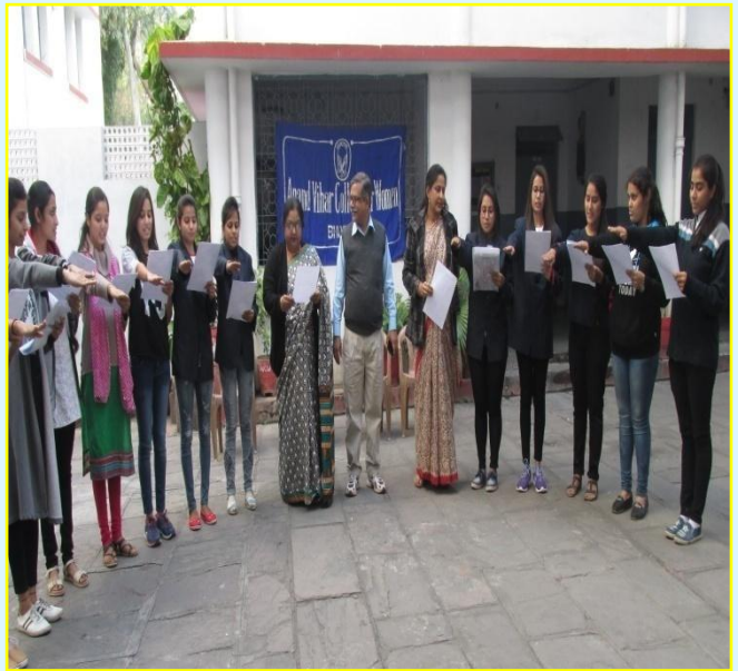
College Elections were conducted in a conducive environment.