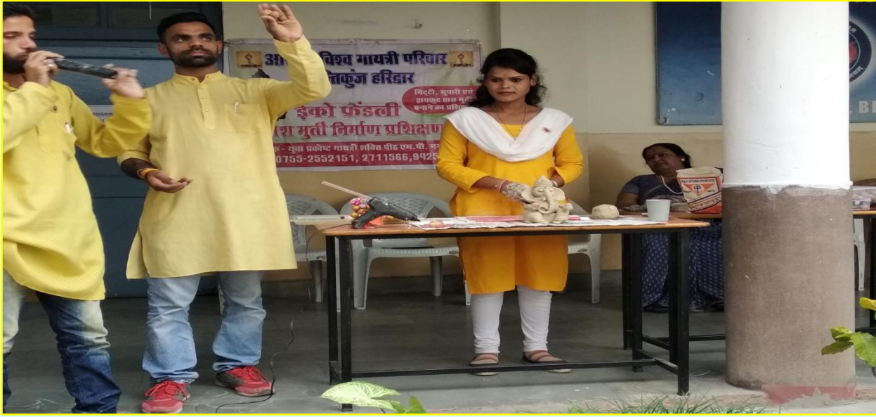
A Workshop on “ Eco Freindly Ganesh Murti Making “ organized by Akhil Vishwa Gayatri Parivar ,Bhopal at College Premises