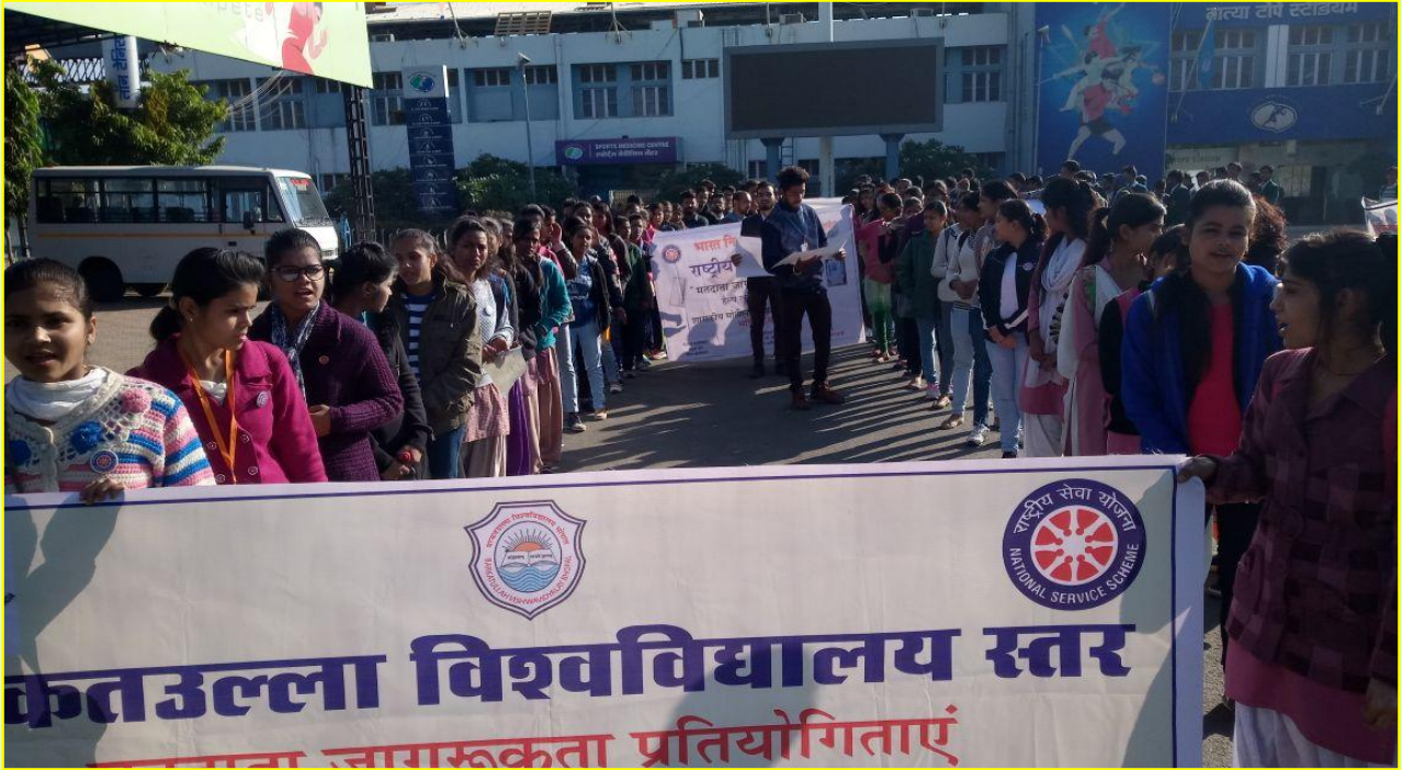
10 N.S.S. students of college participated in Voter Awareness Rally at Lal Pared Ground as directed by Barkatullah University.